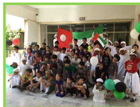
UAE National day event