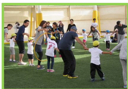
Sports day event