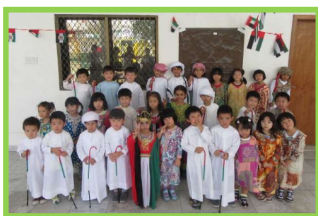
UAE National day event