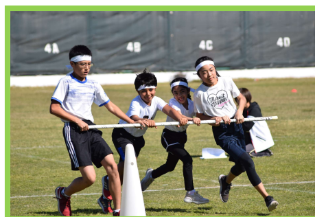
Sports day event