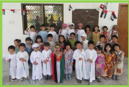
UAE National day event