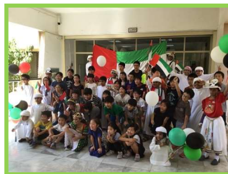
UAE National day event