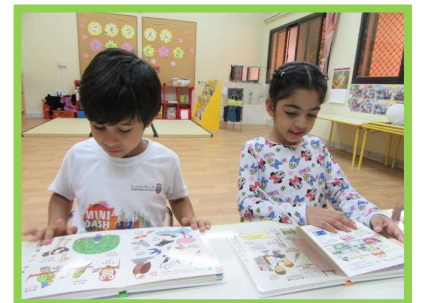
Extra Japanese Class

Activities ; Rhythmic play, Music, Arts, Craft, Swimming, P.E, Outdoor play