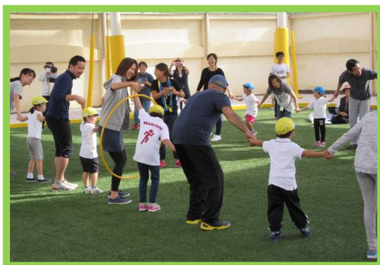
Sports day event