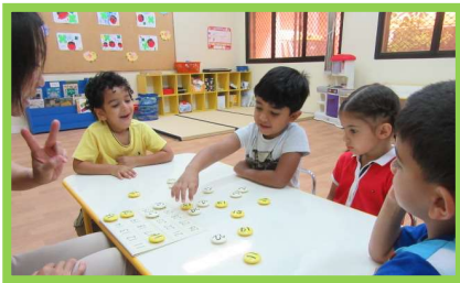
Extra Japanese Class