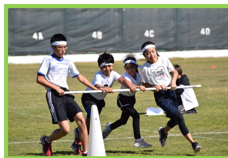
Sports day event